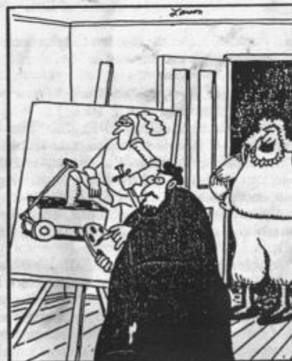
"So, Andre!... The king wants to know how you're coming with 'St. George and the Dragon'."

Will be judged by public acclaim and variety. Period style comparisons will be looked upon favourably.