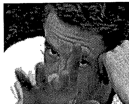
Tim the Enchanter gestures hypnotically.