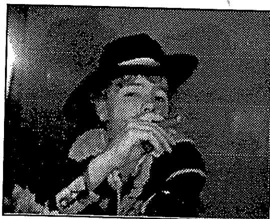
Boozer looking suave and sophisticated. He was sober, which probably made all the difference.