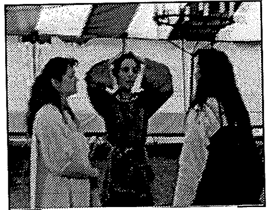
Carmina Semper practice their art.