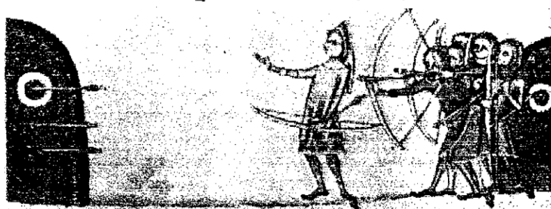
Figure 1. Archers practicing at the earthen butts from the Luttrell Psalter. Note butts at either end of would reduce amount of walking between ends.