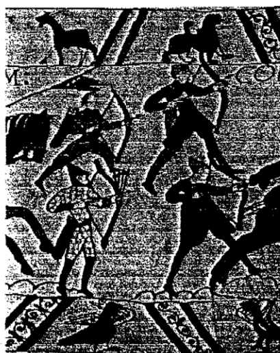
Figure 2. Norman Archers from the Bayeux Tapestry, archer in lower left corner only archer wearing armour and archer in top left corner is the only archer to wear a quiver in the shoulder position.

Web site; Ftp://rtfm.mit.edu/pub/usenet/alt.archery